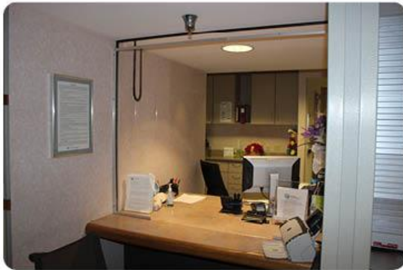
Figure 4, Plexiglas installed at Front Admissions