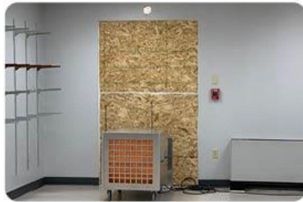
Figure 3, Med/Surg Soft Wall and Negative Air System.