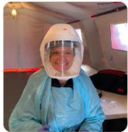
Figure 6, EMA Disaster Tent and Staff